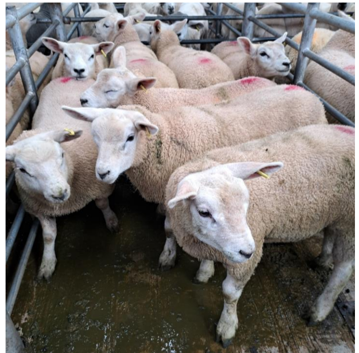
Lambs from DJ Digwood sold to 418p/kg